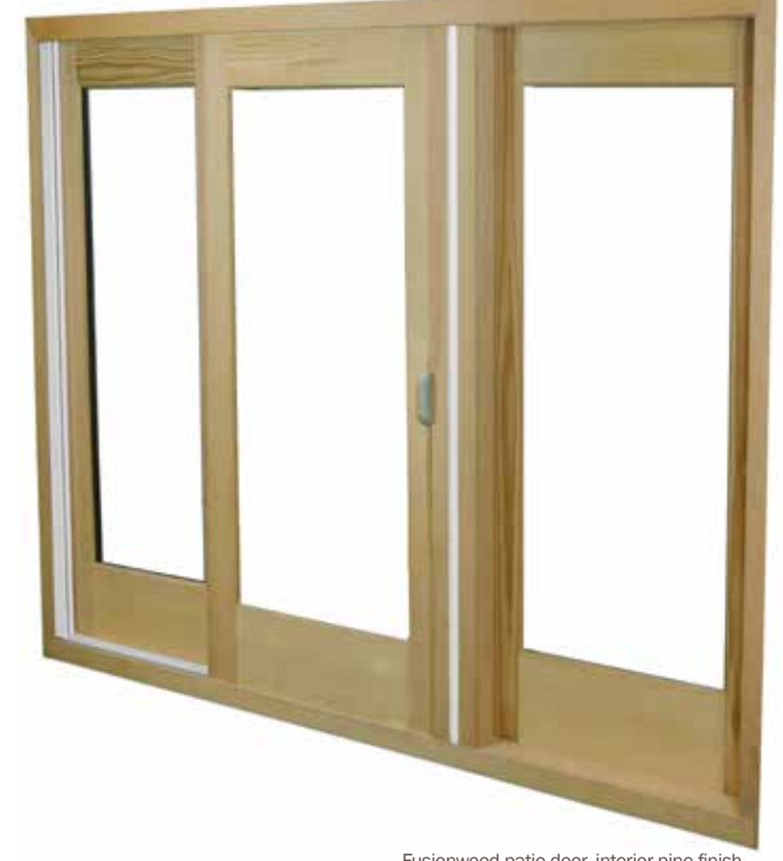
Fusionwood patio door, interior pine finish