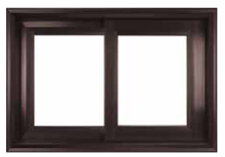
Horizontal Slider viewed from outside Bronze finish