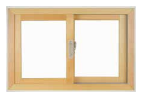
Horizontal Slider viewed from inside Pine finish